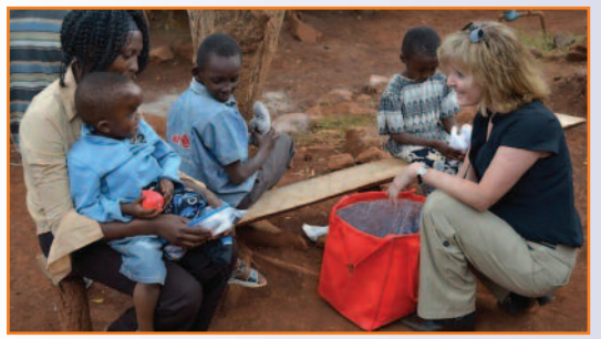
Made site visit to Kenya.