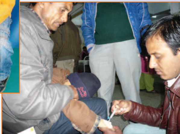
Donated factor to the Nepal Hemophilia Society for various patients in need.