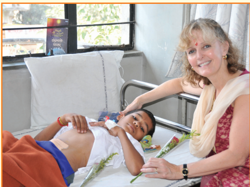
Made site visits to the Dominican Republic, Haiti, Jamaica, Kenya, and India.