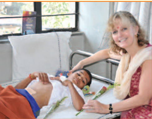
Made site visits to the Dominican Republic, Haiti, Jamaica, Kenya, and India.