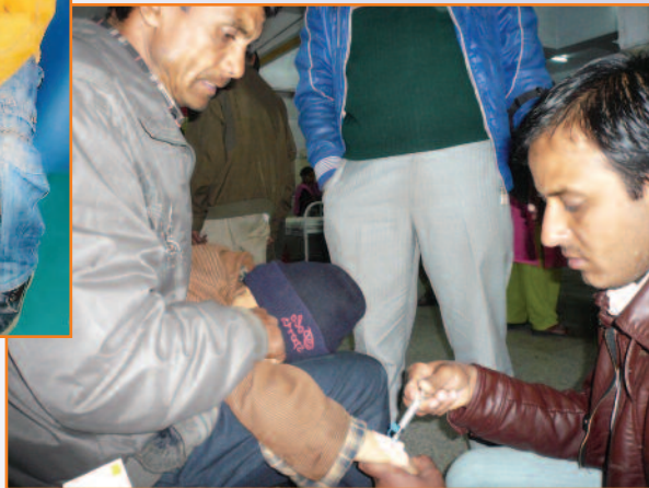
Donated factor to the Nepal Hemophilia Society for various patients in need.